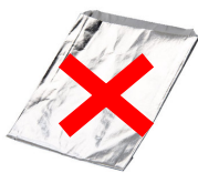
Aluminum foil with paper e.g. burrito wrapper